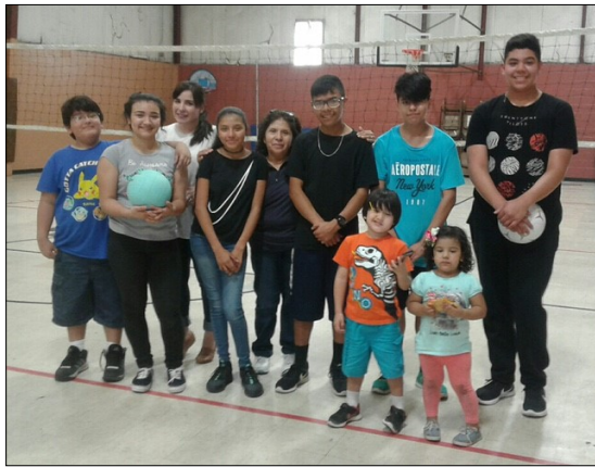
The Bus Stop Ministry enjoying some "gym time" during Spring Break!!