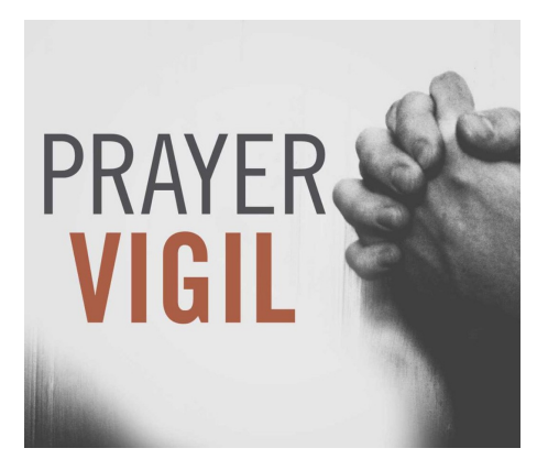
Prayer Vigil Sign-Up Sheet for 30-minute slots will be available soon.