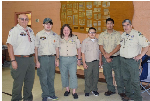
Boy Scouts & their leaders