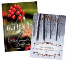
CHRISTMAS CARD SET

Calendars and Christmas cards are now available at $7 for each item.