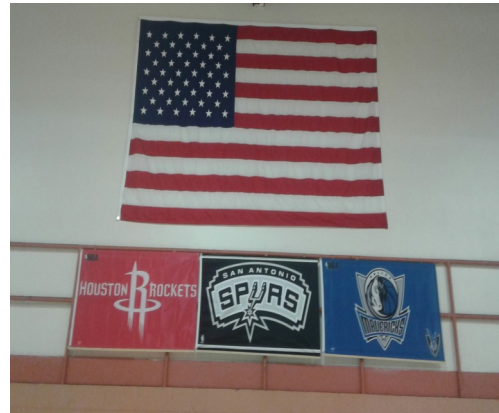
A patriotic addition to Highsmith Gym!