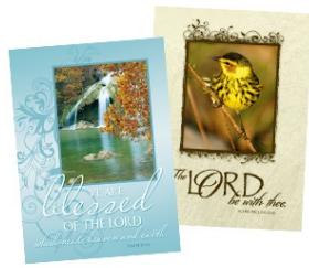
GREETING CARD SET

Calendars and Christmas cards are now available at $7 for each item.