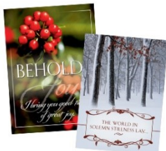
CHRISTMAS CARD SET