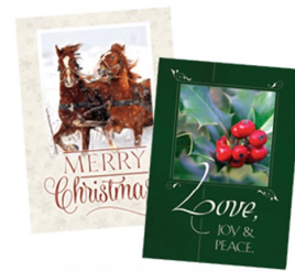
CHRISTMAS CARD SET