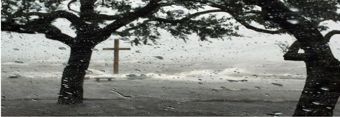
Photo "anchor holds" by Victoria Barlow, Berlin United Methodist Church

United Methodists join in prayer for those in the path of Hurricane Florence and storms around the world as well as those offering disaster relief.