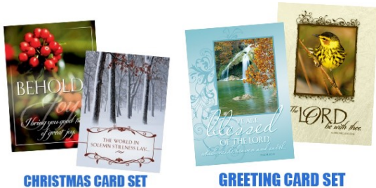
CHRISTMAS CARD SET