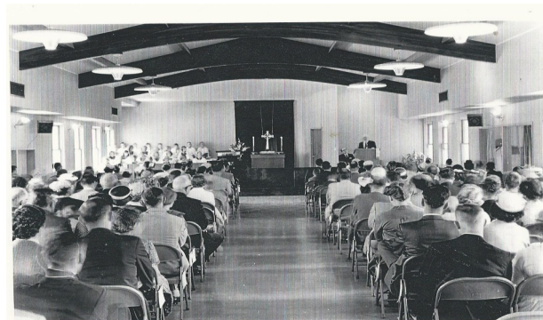
For where your treasure is, there your heart will be also. Matthew 6:21